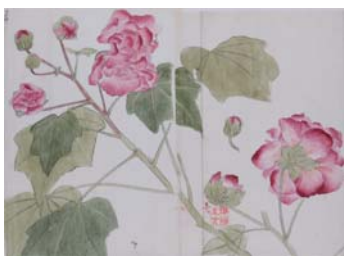
From Kinka Shokubutsu Zusetsu

This comprises a collection of 188 manuscripts written by Keisuke Ito, a pioneer of modern botany in Japan