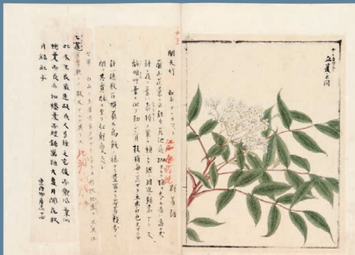
Rosaceae Sorbus commixta from Ito Keisuke collection "Kinka shokubutu zusestu" at Nagoya University Central Library