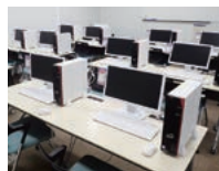
Seminar Room B

*You can use it after making a request. Please apply for it using your ID card.